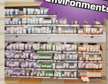
Suture Supply Storage